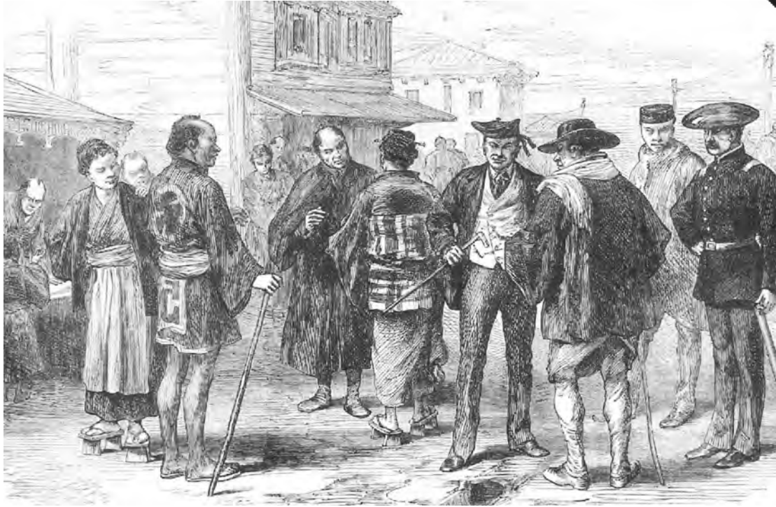
Japanese people wearing traditional and western costumes in 1873.