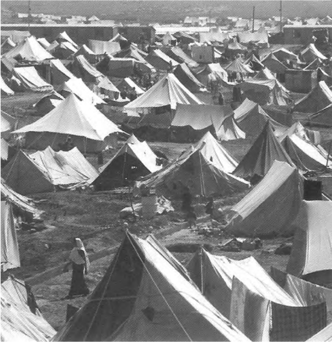
A photograph of a Palestinian refugee camp in Jordan, 1949.

21 Look at the photograph, and then answer the questions which follow.