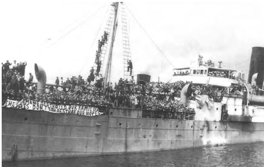
A refugee ship arriving in Palestine in 1947. The banner on the ship reads 'The Germans destroyed our families and homes – don't you destroy our hopes.'

20 Look at the photograph, and then answer the questions which follow.