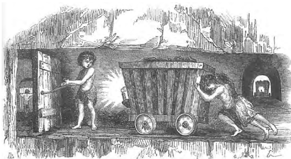
An illustration from the 1842 Report of the Royal Commission on conditions in coal mines.

22 Look at the illustration, and then answer the questions which follow.